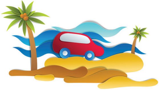
Silver Springs Park